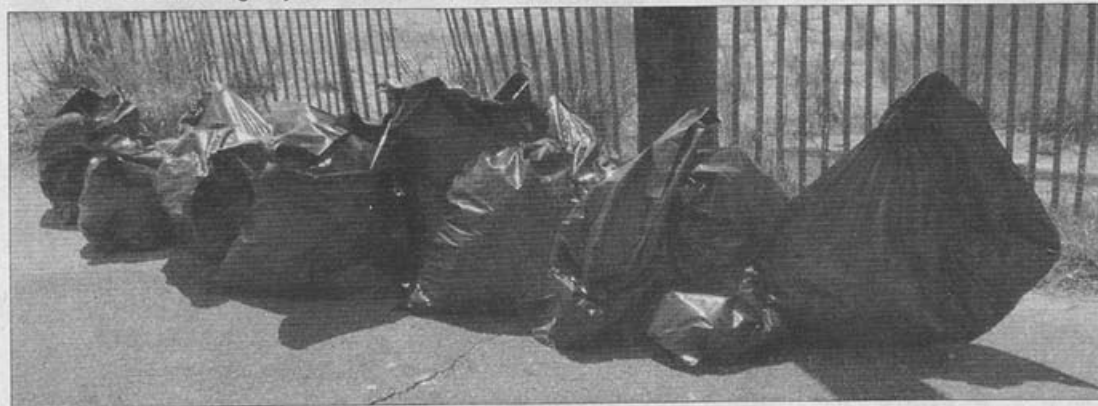
Rubbish from the cleanup.

"The conservation of Rockaway's shores through stewardship is a never-ending task," said the spokesperson, "and we believe that the students and community members experienced that even more than ever on the special Community Cleanup. We hope that all community members will take time out of their busy schedules to marvel at the beauty of our shores making every day their own Earth Day."