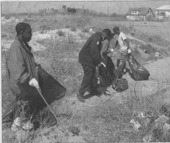
Students diligently collect trash from the area.

Local students and community members have ventured out with Rockaway Waterfront Alliance to regularly keep the shoreline clean for the summer season.